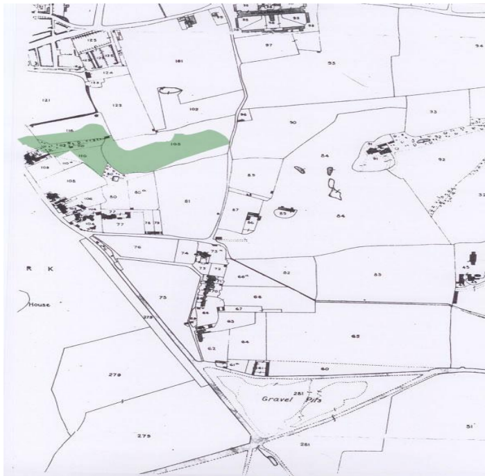
Map 2 1843: Vanbrugh Hill is still an undeveloped country lane. The numbers on each plot of land on this tithe map can establish who owned the site in the early Victorian days. Please note the green shaded area shows the current boundaries of the Westcombe

of Westcombe House from 1829 to 1843. So even in those days, the Woodlands were a largely forbidden area to the rear of rich people's private homes and stoutly fenced against undesirables and trespassers.