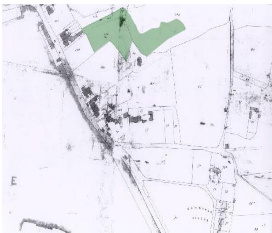
Map 1 1837: The distinctive zig-zag shape of the modern Westcombe Woodlands is already apparent, as field boundaries. More houses have been built on Maze Hill and on the rural lane that would later become Westcombe Park Road. Please note the green shaded

After Vanbrugh Castle was built, other houses followed on the north east side of Maze Hill, leading towards the river (see Map 1). The substantial Maze Hill House, which had its origins as early as 1718 but much enlarged in the early nineteenth century and demolished in 1934, stood on the site of what the present Nos 69-105 Maze Hill, and some of its pleasure grounds were taken for the cul-de-sac.