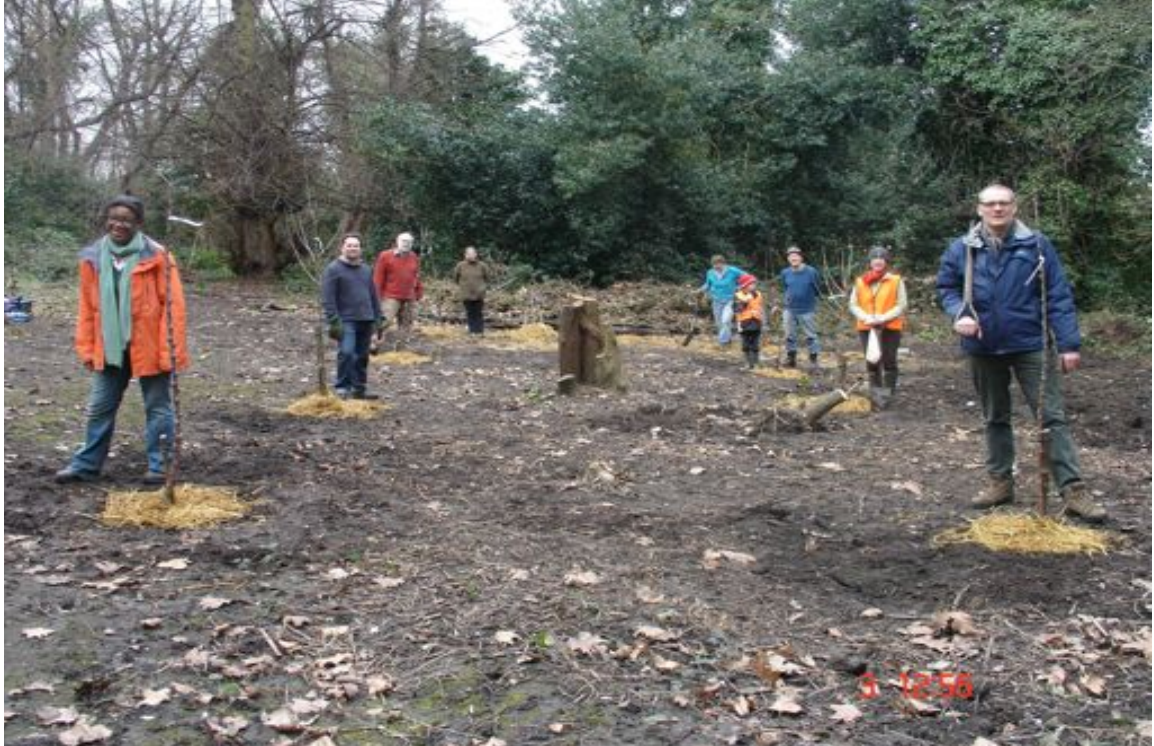
EC members and volunteers standing beside newly planted apple and pear trees

Friends of Westcombe Woodlands Spring 2013 Issue No. 2